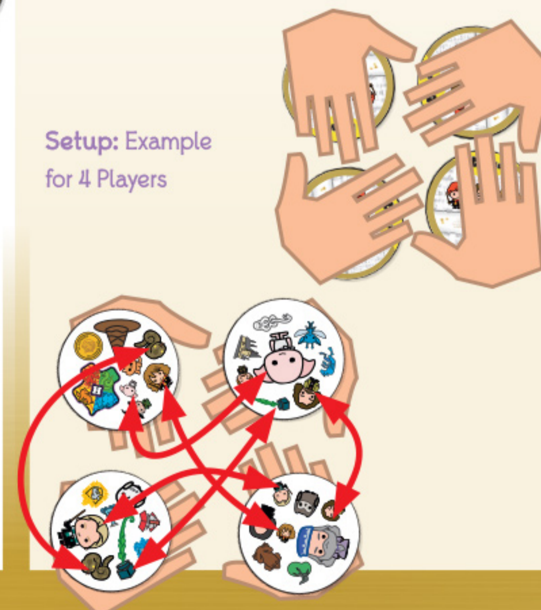
Setup: Example for 4 Players

4) Winning the Game: At the end of the last round, the player with the fewest cards in front of them wins.