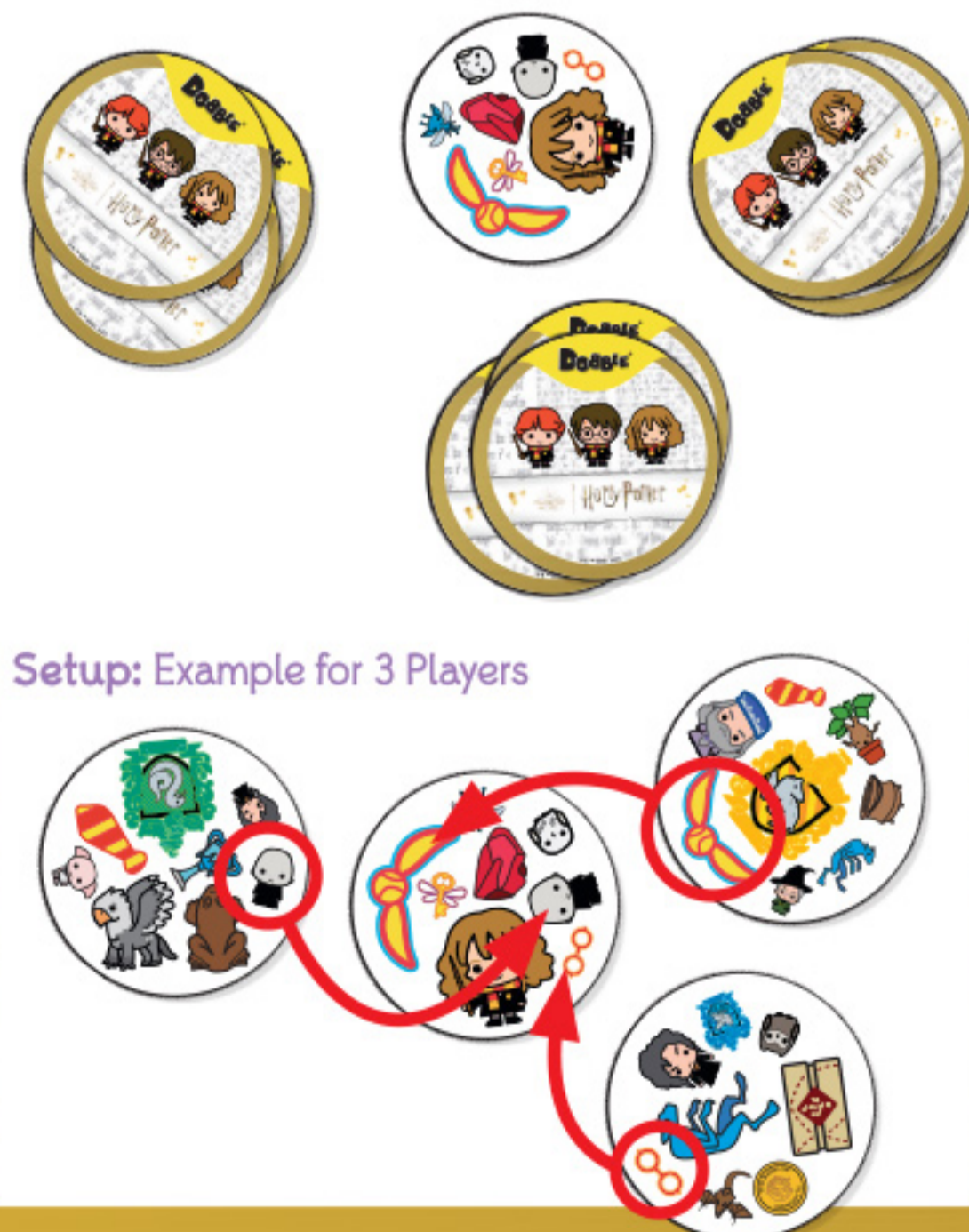
Setup: Example for 3 Players

4) Winning the Game: The first player to run out of cards wins.