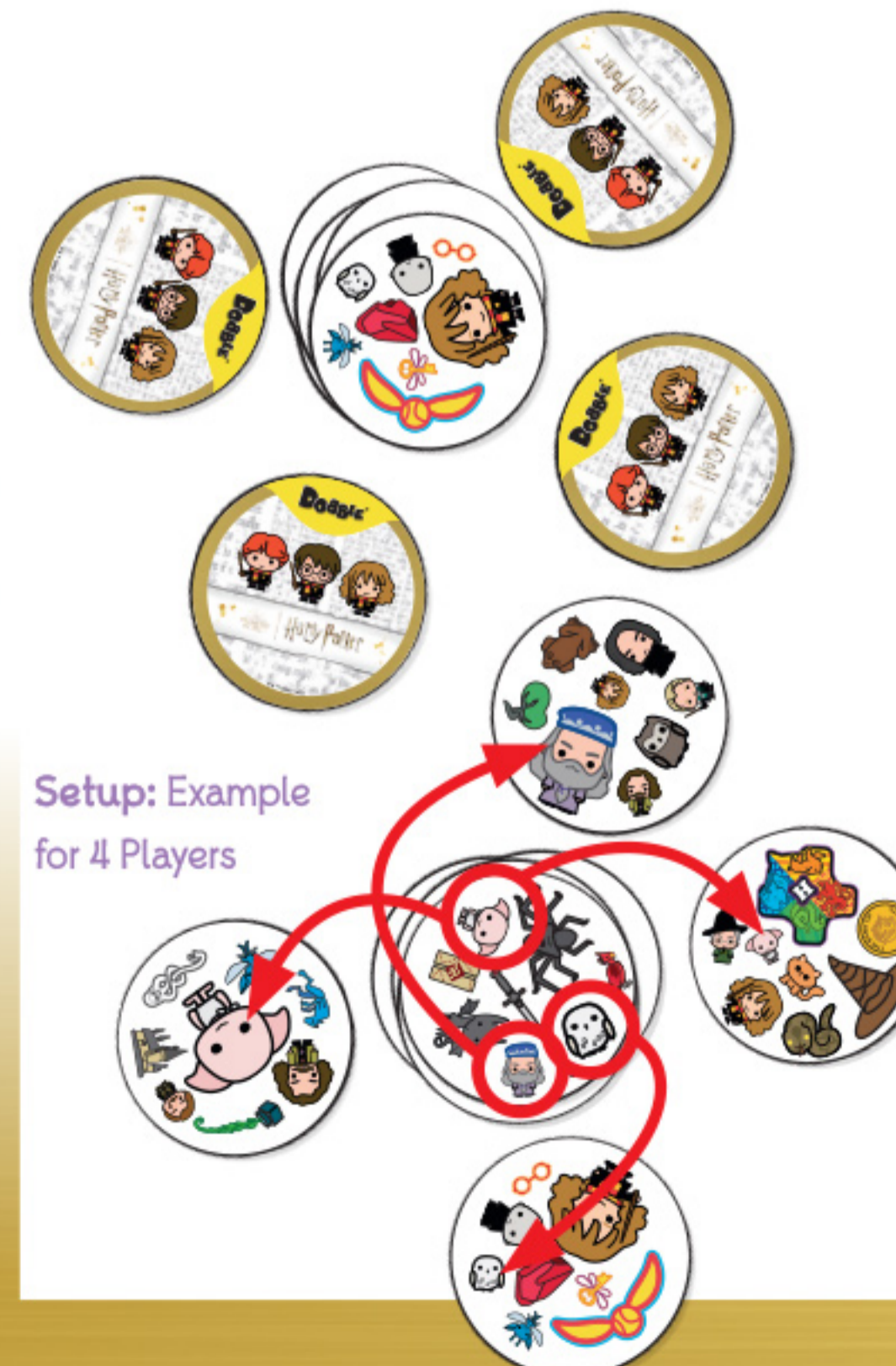
Setup: Example for 4 Players