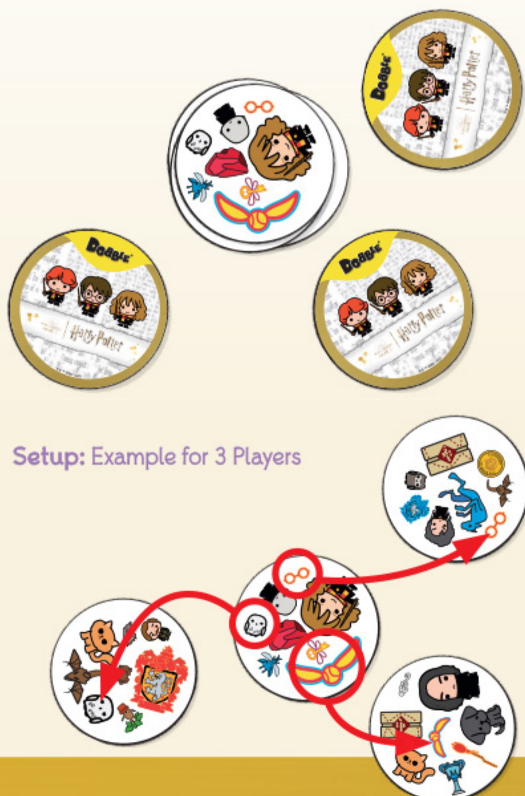
Setup: Example for 3 Players

4) Winning the Game: The player with the most cards wins.