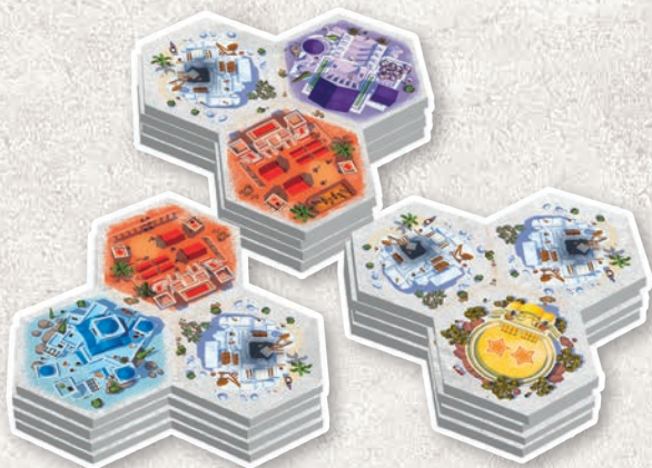
61 City tiles