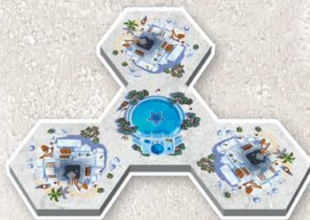
4 starting tiles