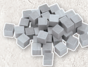
40 Stone cubes