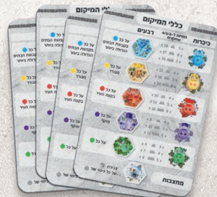
4 Player aids