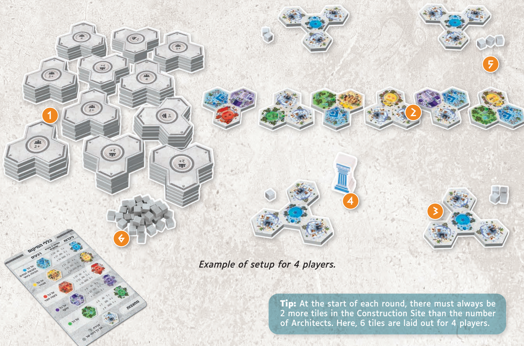
Example of setup for 4 players.

Tip: At the start of each round, there must always be 2 more tiles in the Construction Site than the number of Architects. Here, 6 tiles are laid out for 4 players.